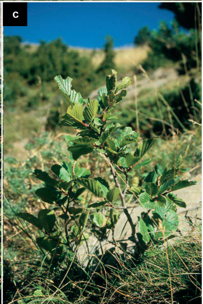
Fig. 1. View of the common pastures in the study area (a), Rhamnus pumila (b) and R. alpina (c) host plants of Satyrium spini .