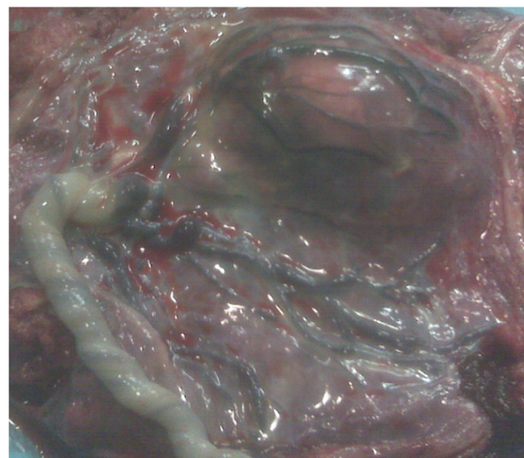
Figure 2 Macroscopic view of giant placental chorioangioma.

was composed of predominantly capillary vascular areas in the fibroid matrix.