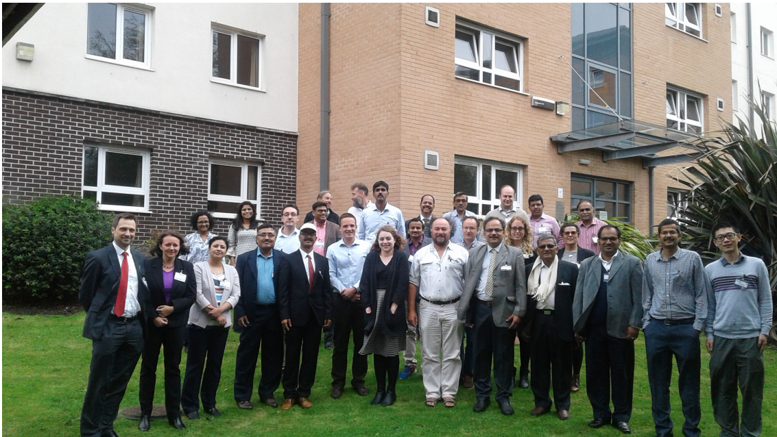
Figure 1: Workshop Delegates being buffeted by the winds in Lancaster

The report is intended for the workshop participants, members of the India-UK Water Centre Open Network, and other policy, business and community stakeholders.