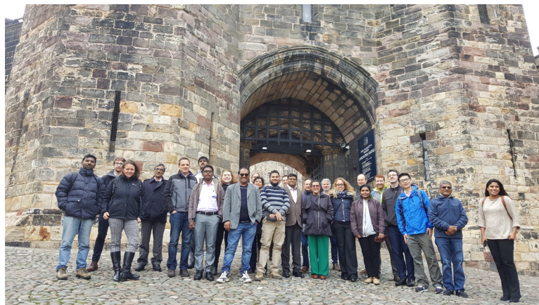
Figure 5: Part of the delegation at the entrance to Lancaster Castle