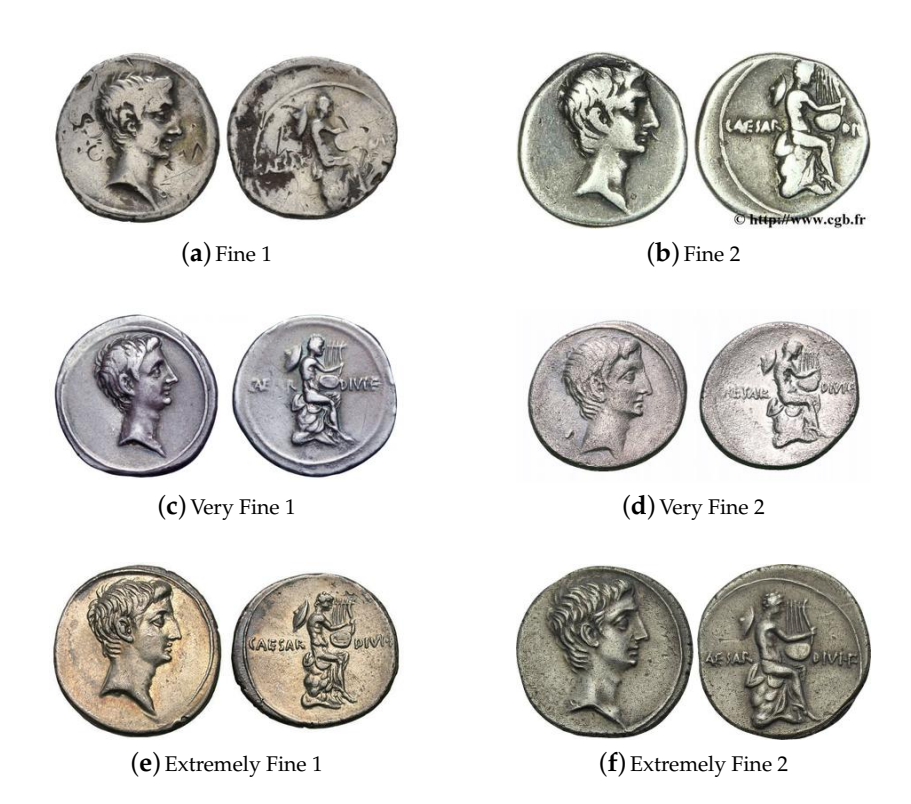
Figure 9. Our data set entry for Octavian Augustus Denarius RIC 257—there are images of two specimens for each of the three conditions included for all denarii issues in the data set (F, VF, and XF).