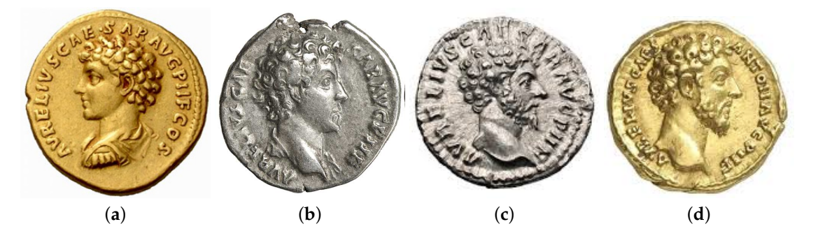
Figure 4. Examples of appearance variability in the depiction of the same individual (emperor Marcus Aurelius) on different coin issues ( a – d ). The challenge of 'face recognition' in this context, involving artistic stylization and abstraction, can be seen to eclipse that of conventional face recognition— a problem which has been attracting an enormous amount of research attention for some five decades, and yet still remains unsolved for nearly all practical purposes.

eventually turned into a text-matching one. This work is still in its early stages, but highly promising results have already been reported using a deep-learning-based framework capable of automatically learning salient concepts and the range of their artistic depiction variability [21].