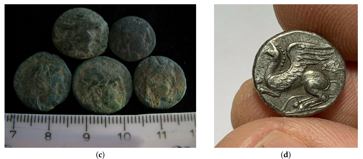
Figure 6. Most ancient coins are sold by private individuals—the non-professional imaging setup used introduces a series of additional confounds and challenges, such as background clutter, poor illumination, partial occlusion, etc. as illustrated on real-world examples ( a – d ).