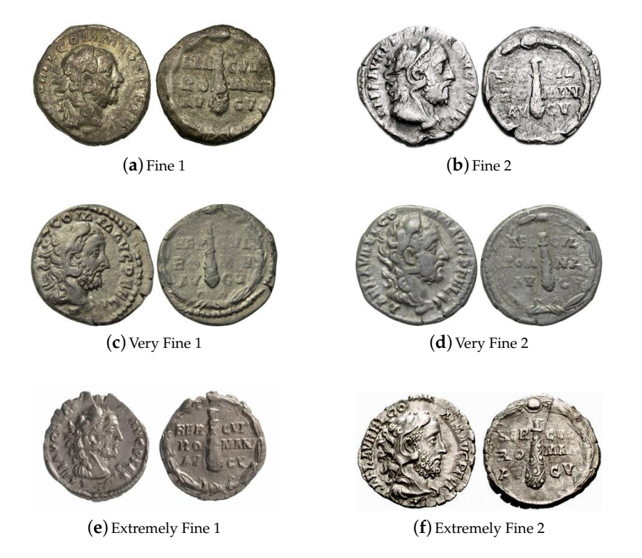
Figure 10. Our data set entry for Commodus Denarius RIC 251—there are images of two specimens for each of the three conditions included for all denarii issues in the data set (F, VF, and XF).