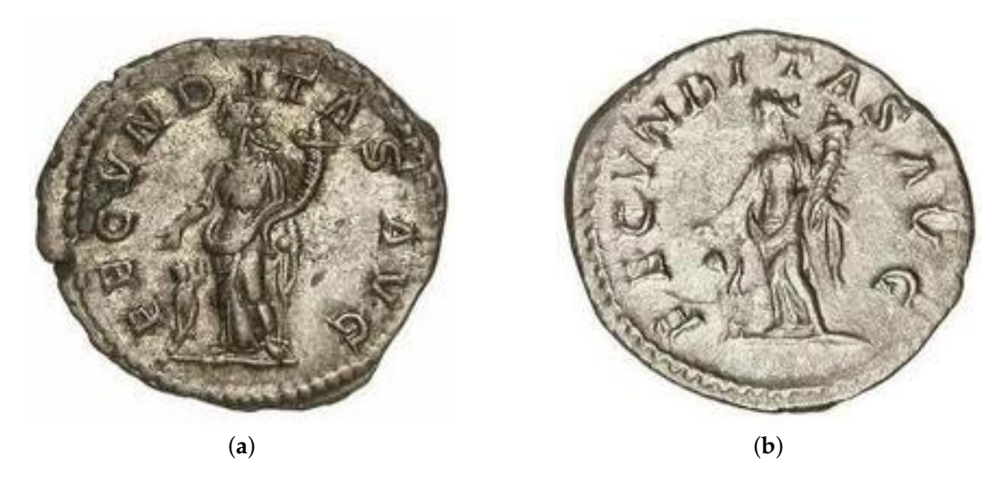
Figure 2. Reverses of two different specimens of the same issue—a silver (AR) denarius of Julia Maesa (RIC 249). Despite them being the same issue, the two specimens exhibit a series of appearance differences. These range from the arrangement of legend letters (e.g., note that the 'I' in 'FECVNDITAS' is to the left—as seen by a reader—of the goddess depicted on the specimen in ( a ) and to the right in ( b )), the exact pose of the child next to the goddess (Fecunditas) or indeed the goddess herself, the flan shape and the centering of the motif within the flan, the damage and loss of fine detail, and the toning ('color' change).

In contrast to specimen matching, issue matching refers to the problem of determining if the coins shown in two images are of the same issue, i.e., if they contain the same semantic content and are of the same denomination (e.g., denarius, anotoninianus, follis, sestertius). This task is the first and probably the most commonly performed one by any numismatist; colloquially put, it answers the question "What is this coin I've got?". In addition to all of the aforementioned challenges outlined in the context of specimen matching, in issue matching, a major challenge of a semantic nature emerges: recall that issues are identified by the corresponding semantic contents, which can exhibit both stylistic variability (e.g., due to different die engravers), appearance change due to physical damage or chemicals in the environment, or die wear, to name but a few; see Figure 2. Recalling from the previous section that the number of different issues of Roman Imperial coins exceeds 43,000, it is not difficult to see why issue matching is inherently an extremely difficult problem [16]. In addition, such a high number of classes makes it all but practically impossible to obtain an annotated gallery of exemplars of all (or most) issues [19,21].