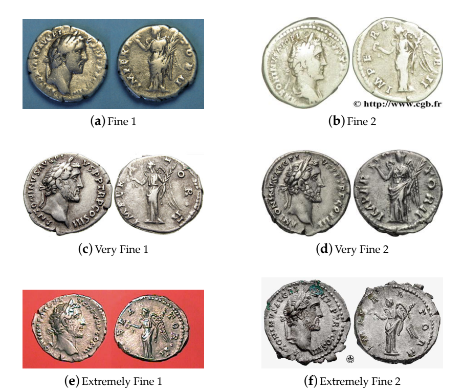
Figure 8. Our data set entry for Antoninus Pius Denarius RIC 111—there are images of two specimens for each of the three conditions included for all denarii issues in the data set (F, VF, and XF).