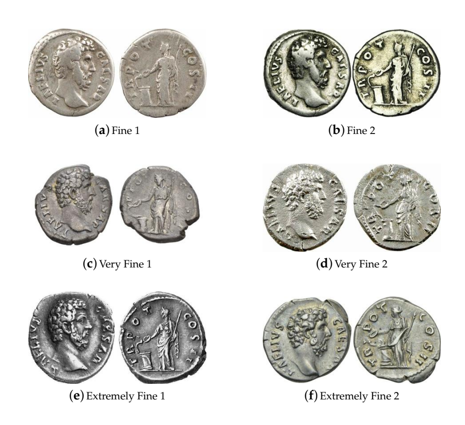
Figure 7. Our data set entry for Aelius Denarius RIC 434—there are images of two specimens for each of the three conditions included for all denarii issues in the data set (F, VF, and XF).