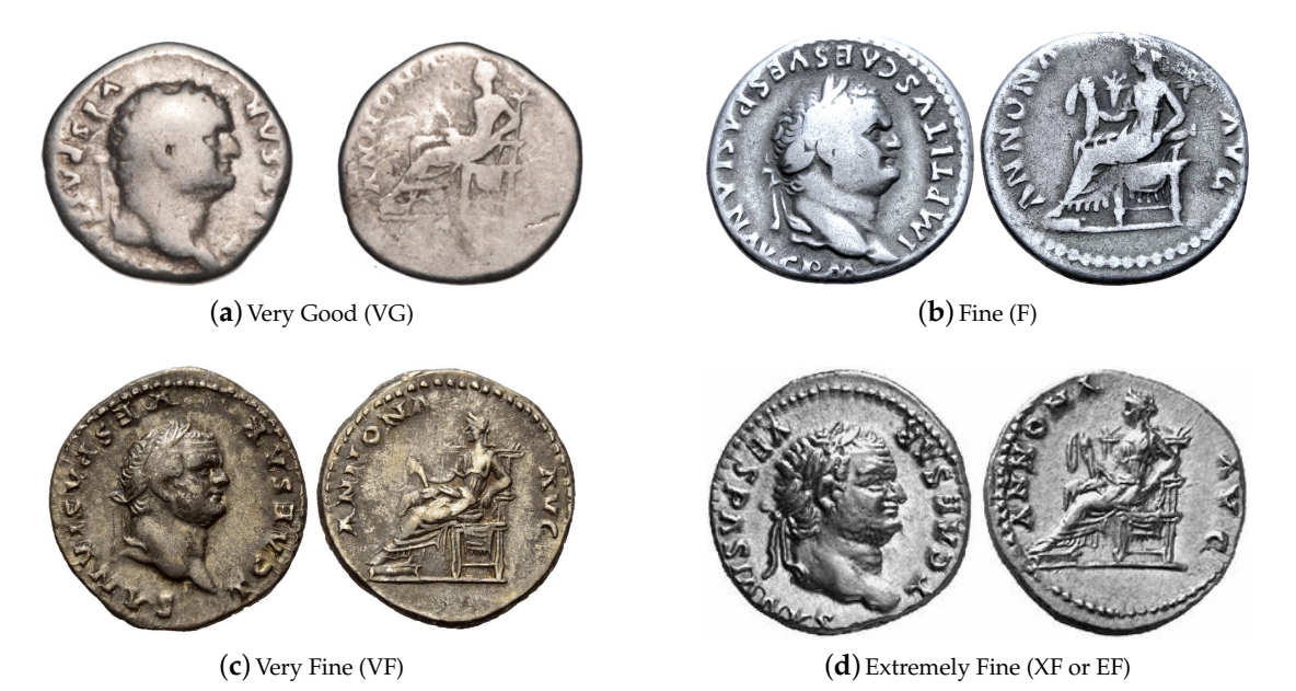
Figure 1. Examples of the same coin issue (denarius of emperor Titus; RIC 972 [Vespasian], RSC 17, BMC 319) in different grades of conservation: (a) Very Good (VG), (b) Fine (F), (c) Very Fine (VF), and (d) Extremely Fine (XF or EF). The two lowest grades, namely fair (Fr) and good (G), are not shown due to the lack of interest in specimens damaged so severely.

coins show wear to minor details, but clear major design elements. Finally, Extremely Fine (XF) coins show only minor wear to the finest details. Examples are shown in Figure 1.