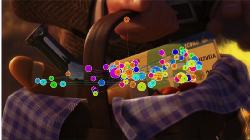
( http://refractory.unimelb.edu.au/wp-content/uploads/2015/02/Fig-5-Batty-et-al.png ) Fig. 5. Gaze plot showing the fixations made by all viewers as they briefly see the contents of the picnic basket.

Researcher C: After looking at some of early scene analyses, I was somewhat surprised by how many eye movements could be made in fleetingly fast scenes, and at how many items in these scenes one could fixate on, if only briefly. I had expected viewers to be taking in some of the surrounding items in a scene using their peripheral vision, and to see more of the centralisation bias (Tatler and Vincent, 2009). Yet for some scenes, in particular for the two scenes in which Carl purchases the surprise airline tickets (see Figs 4 and 5), we see how viewers were drawn to search for narrative clues by looking around the scene.