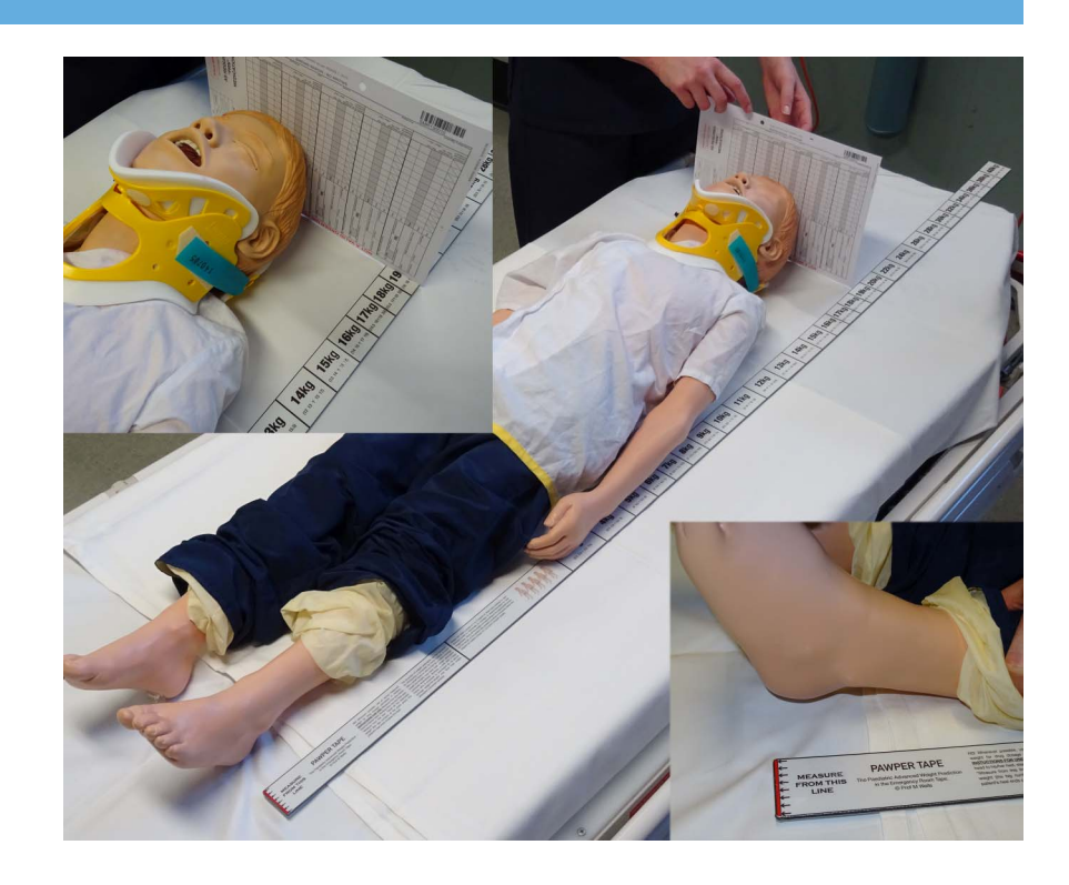
Figure 1 Images showing the demonstration of the Paediatric Advanced Weight Prediction in the Emergency Room (PAWPER) tape.

Advanced Weight Prediction in the Emergency Room (PAWPER) tape (figure 1)<sup>15</sup> <sup>16</sup> and the Mercy method, that modified weight estimations using body habitus.<sup>17–19</sup>