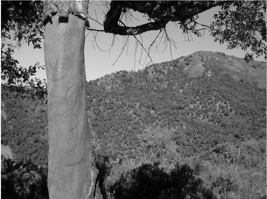
SITE PROFILE FIGURE 8.1. Espadà cork oak forest (eastern Spain).