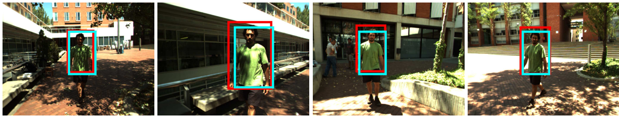
Figure 3. Detection results. Cyan rectangles are correct detections and red ones are their ground truth.

a true positive detection is considered, otherwise, such detection is considered as a false positive. This overlap ratio is computed as \frac{|B_g \cap B_d|}{|B_g \cup B_d|} > 0.5 . Finally, the performance of the detector is measured by using a Recall-Precision curve that is computed by true and false positive rates evaluated for various detector thresholds ( \beta ).