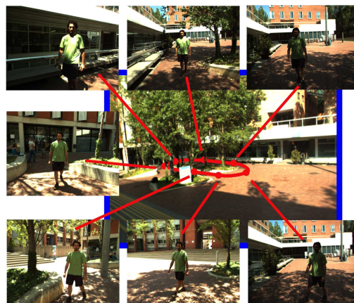
Figure 1. Image sequence examples.

Object detection is still a hard problem that have raised much interest in the research community. This is reflected by the large amount of literature on this topic. Techniques based on Histograms of Oriented Gradients (HOGs) have received a lot of attention since its introduction by Dalal et al. [2]. The key idea behind HOGs is that local object shape and appearance can be captured by local histograms of image gradient orientations, calculated over a group of pixels referred to as a cell. The combined histogram entries of several cells form the HOG descriptor, which is usually normalized to gain partial invariance to illumination changes. The original work by Dalal et al. used a dense and overlapping tiling of cells within the detection window with local contrast normalization for pedestrian detection in static images. In a similar way, SIFT features [5] compute fixed HOG descriptors in a grid of 4x4 cells and 8 gradient orientations around interest points. These image descriptors are translation, rotation, and scale invariant. They are