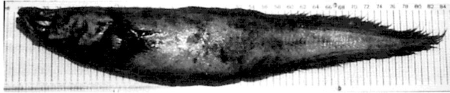
Fig. 1. Cataetyx laticeps , IIPB 31/2000, 678 mm TL, captured in Newfoundland (NW Atlantic).