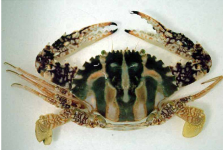
Figure 1. Charybdis feriata (Linnaeus, 1758). Collected near Barcelona, western Mediterranean Sea. Adult female (Carapace width: 125.0 mm; Carapace length: 81.3 mm) (ICMD 16/2005)

gillnets. The specimen has been deposited in the Reference Biological Collections of the Institut de Ciències del Mar (CSIC) in Barcelona, under the access code ICMD 16/2005.