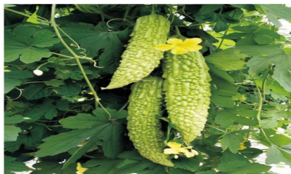
Figure 1. A photograph showing the bitter melon plant and its green fruits.

Herbs and other dietary supplements are used as complementary and alternative medicine either to avoid or to reduce the use of Western orthodox medical treatment. A recent study showed that up to 30% of diabetic patients use complementary and alternative medicines [6]. Since the ancient times, many plants and their extract were used as a treatment for numerous diseases, including diabetes. The WHO has listed 21,000 plants which are used for medicinal purposes around the world. Among them, 150 species are used commercially on a fairly large scale [7]. Bitter melon, which is also known as Momordica charantia ( M. charantia ), is a well-known plant used for treating and preventing diabetes amongst the populations of many tropical countries from Asia, South America, India, the Caribbean and East Africa [6]. M. charantia , is also rich in minerals, including potassium, calcium, zinc, magnesium, phosphorus and iron, and is a good source of dietary fiber and vitamins [8]. The medicinal value of bitter melon has been attributed to its high antioxidant properties due in part to phenols, flavonoids, isoflavones, terpenes, momordicine, anthroquinones and glucosinolates, all of which confer a bitter taste [9]. Figure 1 illustrates the bitter melon plant and its green fruits.