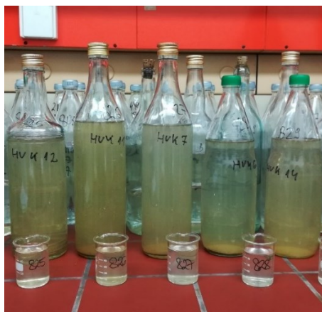
Figure 2. River water samples from the selected locations in north-west Croatia.

Sampling was performed according to the water sampling regulation ISO 5667-6 „Guidance on sampling of rivers and streams“ (5667-6 ISO). Sampling was performed manually, about 15 cm beneath the water surface, and the sample was collected directly into the 1000 ml sampling glass bottles with the bottleneck turned to the water stream ( Figure 2 ). At each location one sample was taken. The samples were stored at 4 °C and transferred to the laboratory. Next, the samples were filtrated through 0.45 µm filter paper and the filtrate was transferred to the 50 ml plastic bottles, and ready for measurements. Measuring the dissolved fraction of metals has allowed us to estimate the quantities of the bioavailable heavy metals.