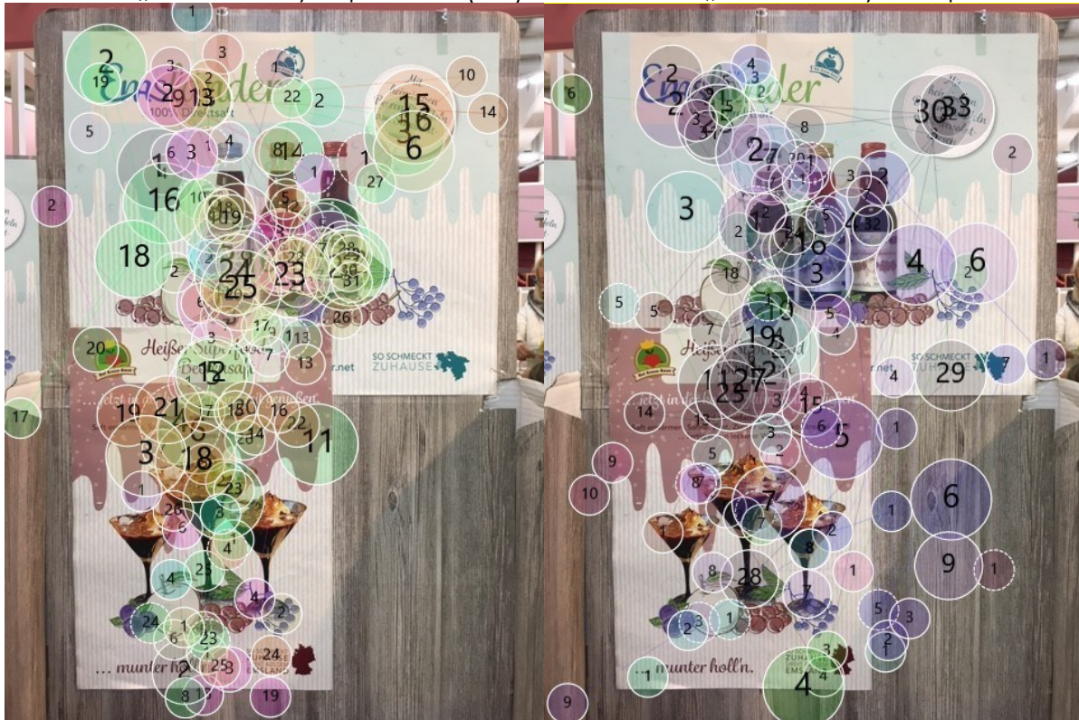
Note: left: illustration of the gaze plot “sustainability important” (n=17), right: illustration of the gaze plot “sustainability unimportant” (n=15)

The results support hypothesis 2 (H2): subjects with a positive attitude towards sustainable and regional foods are more likely to remember individual display elements that visualize sustainability than subjects who are less open to this issue (table 2).