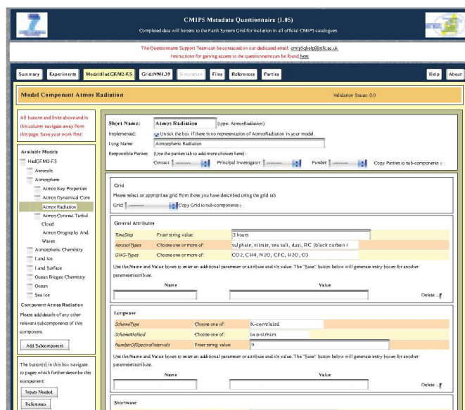
Figure 3: Screen shot of the CMIP5 questionnaire. This screen shot shows part of the entry form for describing the longwave atmosphere radiation scheme; it is generated from the mind map shown in Figure 2.

The mind maps, together with the precise CMIP5 experiment protocol description provided directly by the CMIP panel, were integrated into a web-based questionnaire. Automatic python parsing tools rendered the mind maps structure, questions and controlled vocabulary directly into the questionnaire (Figure 3) clearly separating climate science and IT concerns. The branching structure of the mind maps generated the hierarchy of model components, each with an associated web form. The branching structure also drove the tree navigator (to the left in Figure 3), which allows users to navigate directly to a particular model component. The controlled vocabulary captured in the mind maps generated the questions about the model components and also populated the drop-down lists of standardised responses for each web form. Attached notes in the mind maps appear as explanation tool tips in the questionnaire.