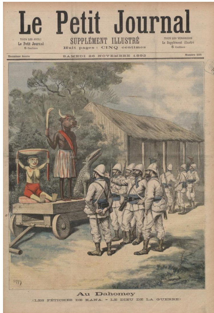
Figure 2 Front cover of Le Petit Journal, Supplément illustré , 26 November 1892.

statue a standing figure holding up a sword and with a bull's head (the 'buffalo'). 26 At the left in the background of the image the animal heads of further sculpted figures flanking the pillars of a building can be seen. The French soldiers adopt relaxed poses as they stand back and contemplate the sculptures, one gesturing towards them while another smokes a cigarette, hands behind his back.