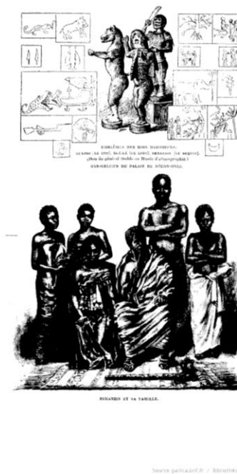
Fig. 3 'Emblèmes des rois dahomiens, Guezou (le coq), Glé-lé (le lion), Behanzin (le requin)', and 'Behanzin and his family', from Eduoard Foà, Le Dahomey. Histoire–Géographie–Moeurs–Coutumes–Commerce–Industrie–Expéditions françaises (1891–1894) , Paris: Hennuyer, 1893, facing page 53.

The final place in Jomard's schema, class 10, was reserved for what he called 'objets de culte', which in a footnote were revealed as taxonomically impossible: 'The rank that cult objects occupy is outside all classification'. 41 The Dahomean statues of Kings Gezu, Glele and Behanzin were of course both 'portraits' and 'cult objects'. These two poles mapped out, arguably, the contested terrain of the reception and evaluation of non-western objects in late 19 th -century and early 20 th -century Europe, where writers and theorists struggled to make them fit into both established Western categories for art works and art production, and to correspond to ethnographic models of understanding.