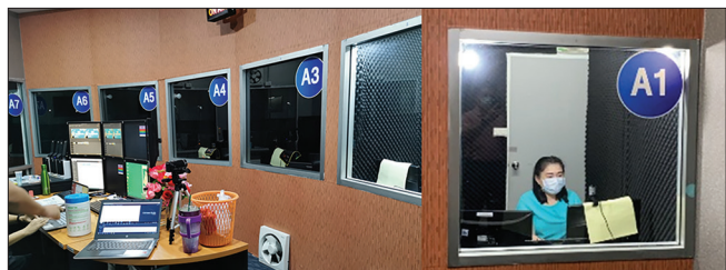
Figure 3: Online delivery of lecture for prevention of COVID

COVID-19 pandemic [25], [26]. Hence, the dentist should manage oral health problems and prevent the spread of COVID-19 in dental practice. Figure 4 shows patient screening flow chat for COVID-19 and dental treatment [23]. A detailed medical history of the patients and their family members should be asked upon their arrival in the dental clinic, such as contact with COVID-19 infected people, history of fever, and travel history in the last 14 days.