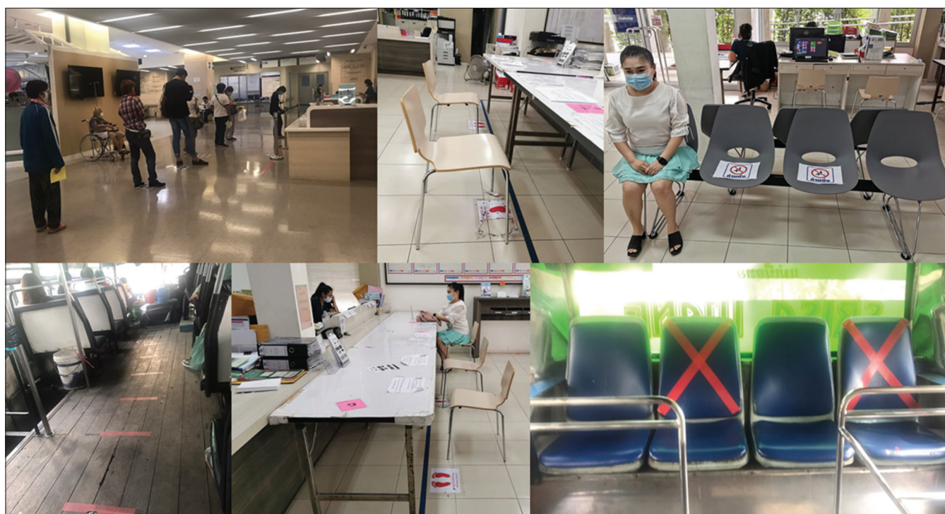
Figure 2: The social distancing of 1-2 meters for COVID prevention in Thailand

Oral health is affected in the pandemic and disaster situations similar to the situation of the