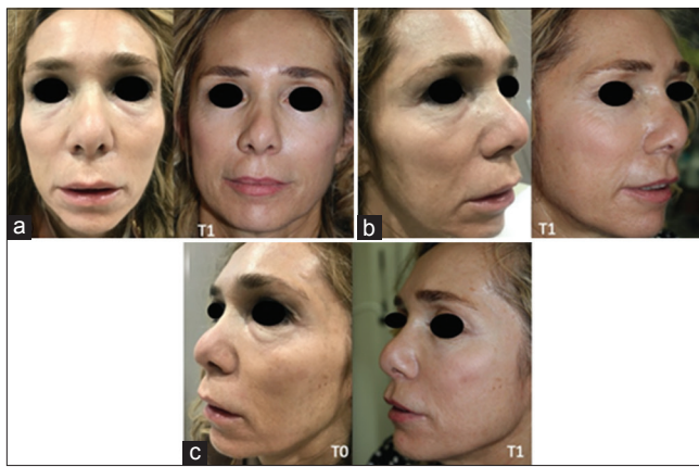
Figure 3: (a-c) (a) Frontal, (b) three-quarter right, and (c) three quarter left views of a 46-year-old lady with a low degree of facial aging. T0 on the left and T1 on the right side of the pictures. The patient applied for 8 weeks retinol cream at home; after “at home treatment,” as the second step performed a 10% TCA peel. One month later, 50 U of BoNTA were used for the upper third (repeated after 6 months), and 1.5 mL of CaHA and 1 mL of HA were used to enhance middle and lower third of the face. At the 4th month, patients received a monthly intradermic injection of non-cross-linked HA and non-ablative radiofrequency sessions. T1 picture has been taken 12 months apart from the beginning of at home application of retinol cream

facial pores, and superficial wrinkles; a comparison between T0 and T1 was performed for all the patients.