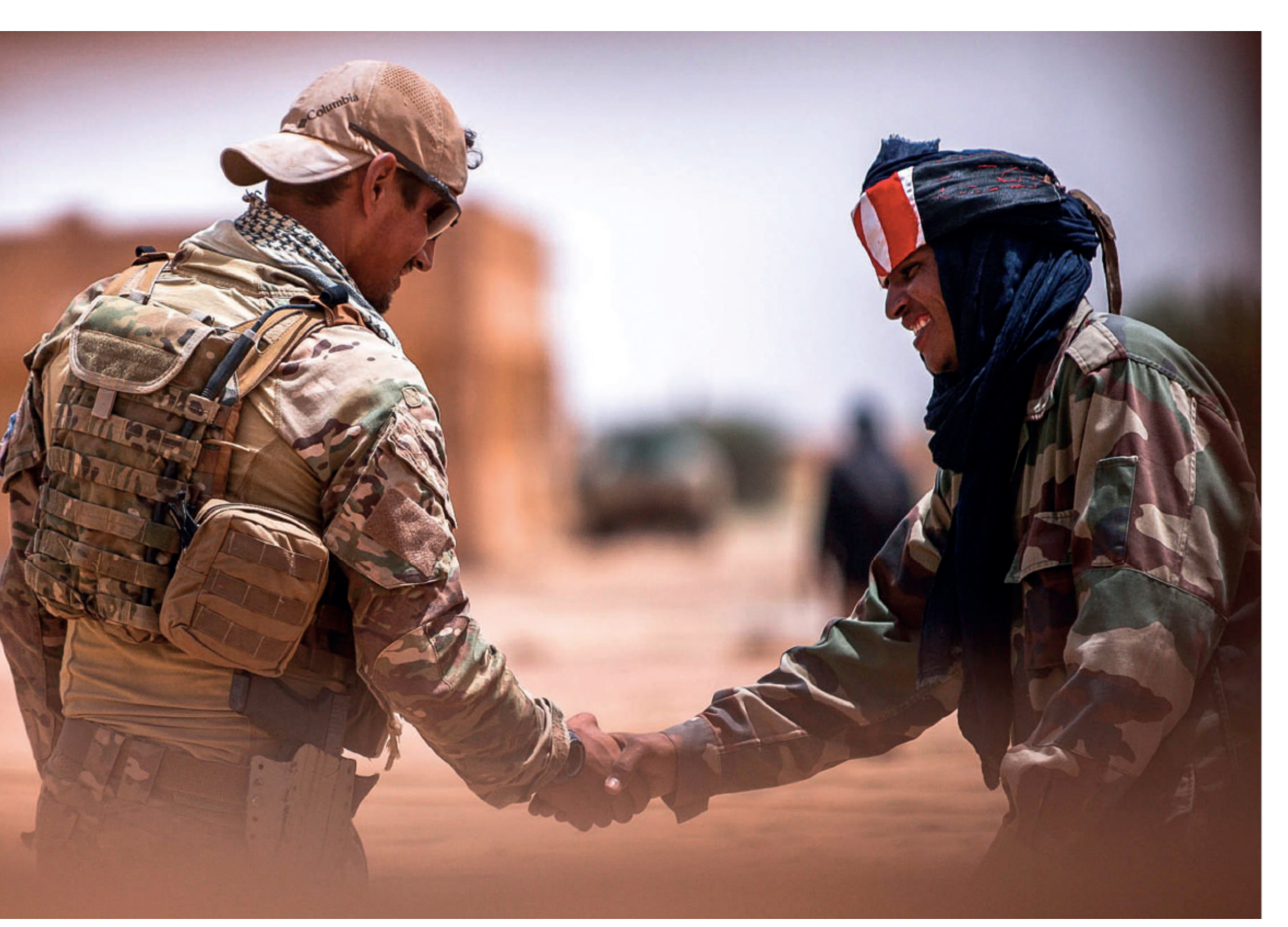
SOF as information gatherers.

How can SOF from small European states most efficiently and effectively contribute to the intelligence capacity needed to forecast and counter threats from foreign regions?