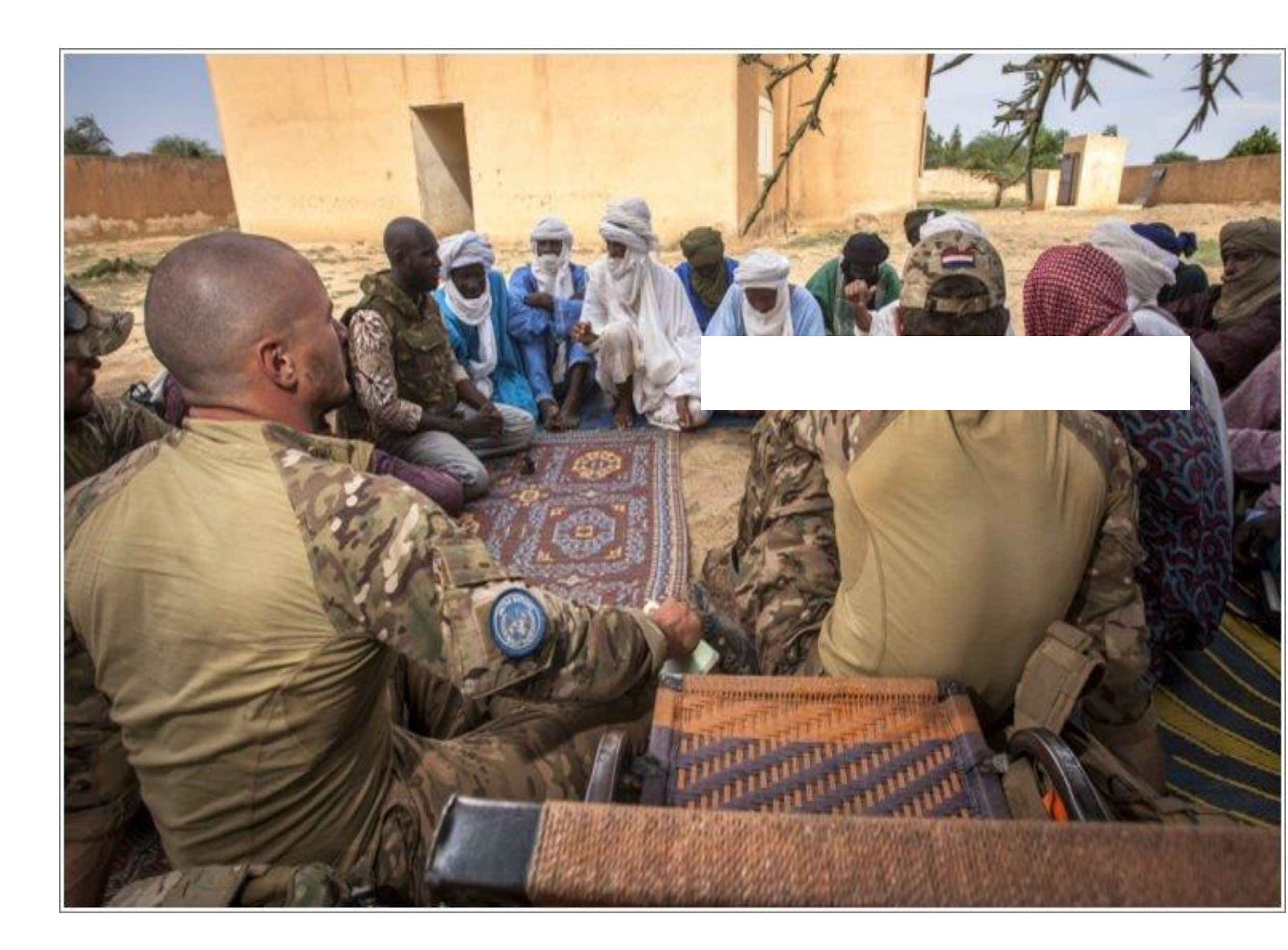
SOF as information gatherers..

In that regard, the integrated option is more congruent with operations in non-permissive areas, and SOF as independent collectors with permissive areas.