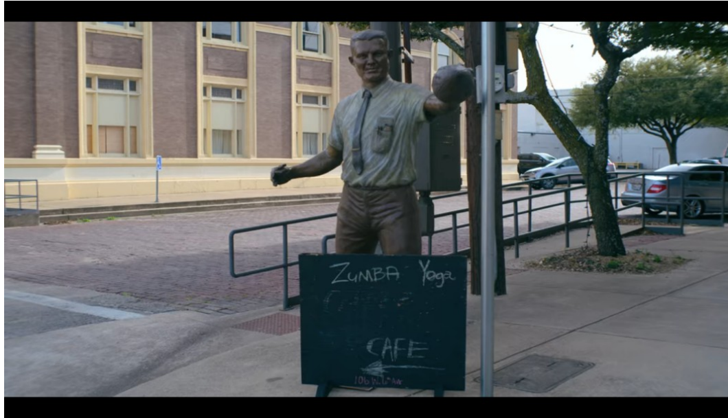
Figure 6: Backdating establishing shot of masculine stature holding out a football

Crawford’s misnomer, aside from its gendered assumptions about the sex of the cheerleaders, labels the women on the team as “gals,” a colloquial term for girls. This misrepresentation suggests the women on the Navarro team are not adults, which as college-age students, they certainly are. As discussed above, mislabeling adults as children—a disjuncture between signifier and signified—is a means of dissociating the rights of adulthood from a group of people. Historically, the racial slander of “boy” or “girl” was used against black adults during three hundred years of slavery and Jim Crow. By categorizing the cheerleaders as “gals,” Crawford playfully defines the cheerleaders out of adulthood and its corresponding rights. Thus, the cheerleaders’ feminization—represented by Crawford’s misrepresentation of the cheerleaders as entirely femme—is associated with their marginalization as a group of adult athletes.