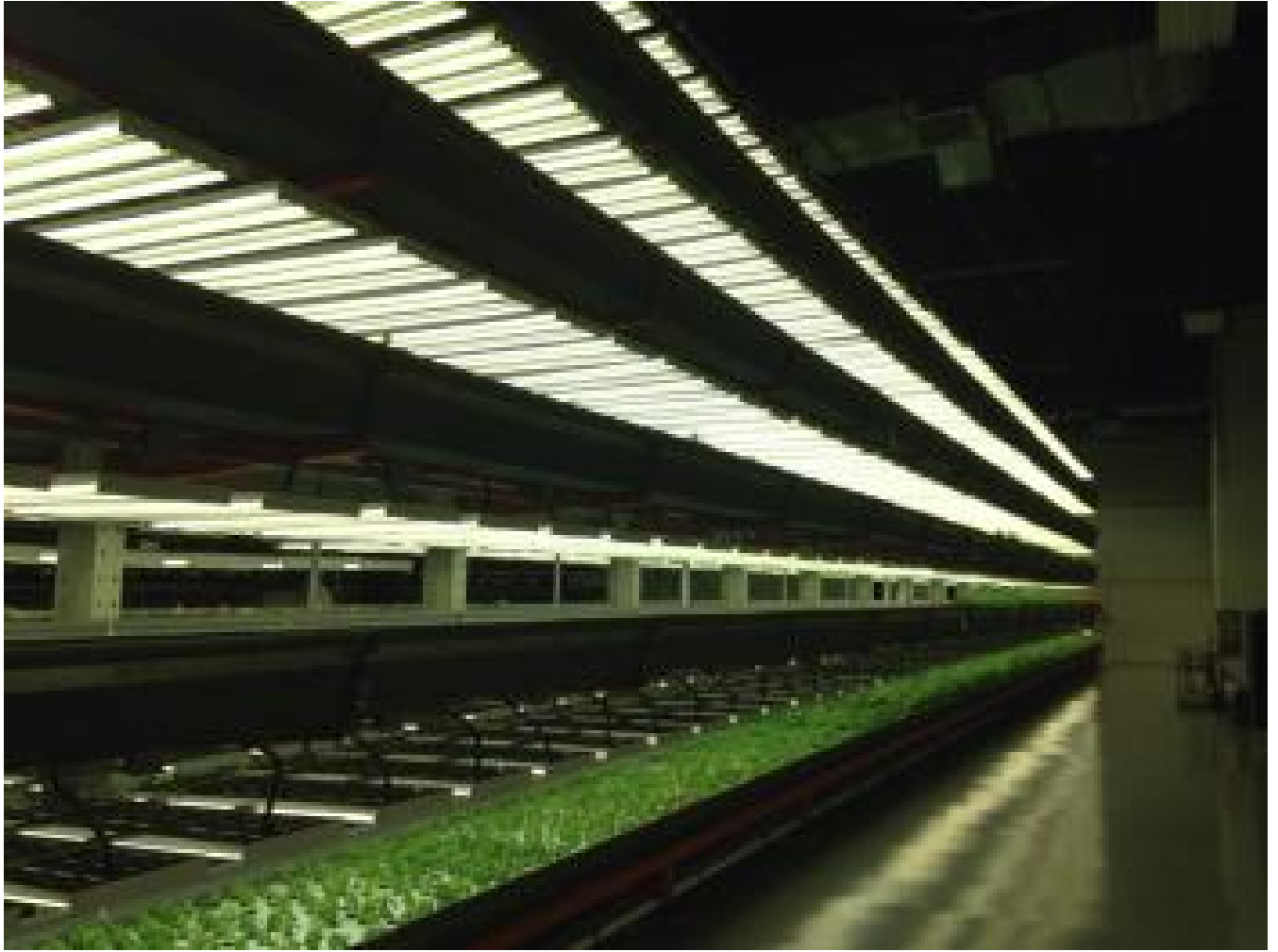
Farmedhere, Chicago, Illinois

http://chicagotonight.wttw.com/2014/06/23/vertical-farming-s-rise-chicago