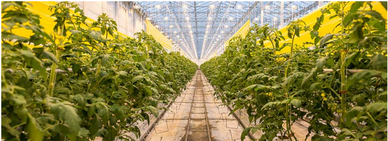
Backyard Farms, Maine

https://www.backyardfarms.com/how-we-grow/our-greenhouse