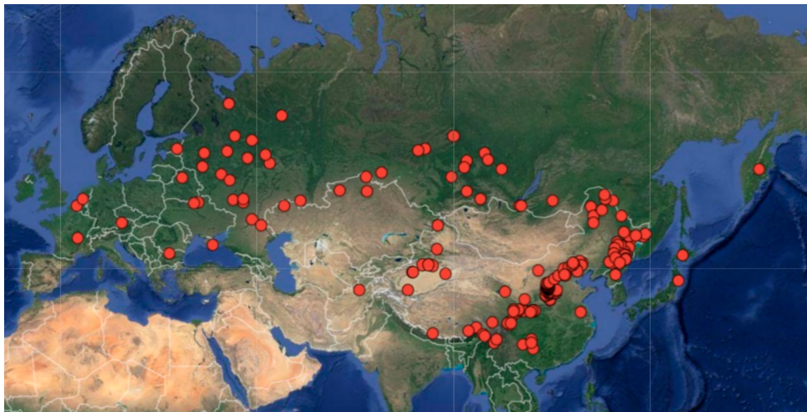
Figure 1. Allocation of sample plots with biomass (t/ha) determinations of 413 Populus forest stands in the territory of Eurasia.