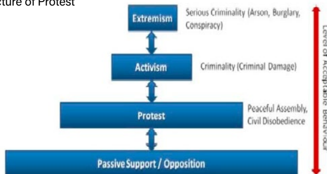
[Fig 1, 'The Structure of Protest', NPCC 2016]