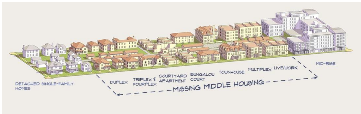
Figure 6: Illustration of missing middle housing types (Missing Middle Housing, 2018)

Missing middle is a range of multi-unit or clustered housing types that are comparable to the scale of single-family houses. Most commonly they are duplexes, fourplexes, and bungalow courts. Upzoning would allow for these forms of housing to exist in previously restricted single-family zones, where only one unit is allowed per lot. Increase in this housing stock could allow for a more walkable environment and increase affordability by design (Missing Middle Housing, 2018).