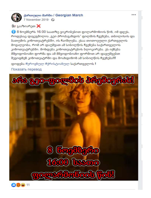
Figure 6: Georgian March Trailer for And Then We Danced <u>https://www.facebook.com/QartuliMarshiGeorgianMarch/</u>

The term 'gay propaganda' was again used widely by Sandro Bregadze to describe the film (Dalton, 2019), and the Facebook posts encouraging GM supporters to protest feature the slogan prominently (Figures 5 and 6 below).