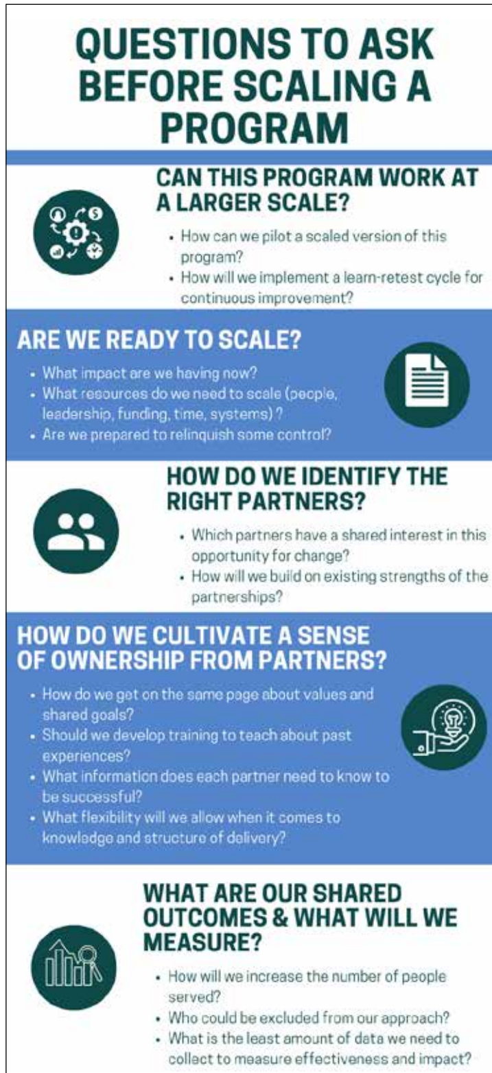
FIGURE 2 Questions to Ask Before Scaling a Program