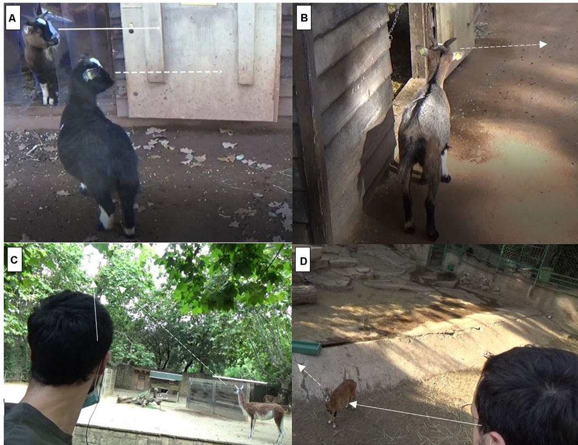
FIGURE 1 | Experimental setup for the two tasks and conditions: (A) Conspecific experimental trial. (B) Conspecific control trial. (C) Human experimental trial. (D) Human control trial. Continuous lines indicate the model's gaze direction, while dotted lines indicate subjects' gaze direction when trials were coded as positive.

was stronger in the conspecific task (conspecific task: p < 0.001 ; human task: p = 0.016 ; see Table 2 ). Moreover, while all species overall followed the model's gaze more in the experimental than in the control condition (see Figure 2 ), goats ( p < 0.001 ), llamas ( p = 0.002 ), and mouflons ( p < 0.001 ) did it significantly so, but not guanacos ( p = 0.638 ).