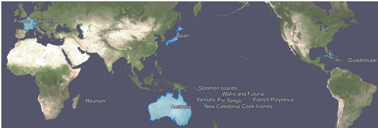
FIGURE 1 | Country of origin of the members of the ManaCo consortium.