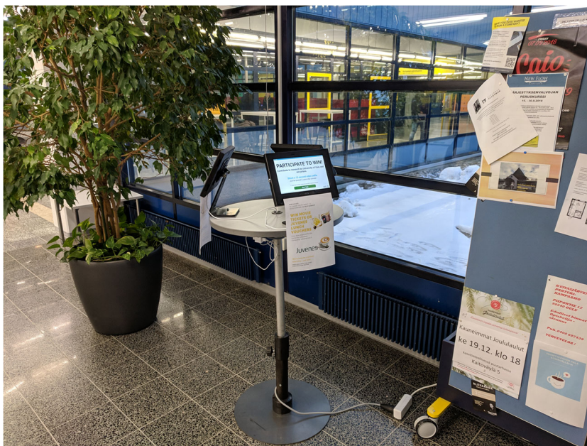
Fig. 1 The VideoSourcing desk deployed at the corridor of our campus

small groups of people [49] or TeamSourcer in exploring team dynamics in a collocated crowdsourcing setup [25].