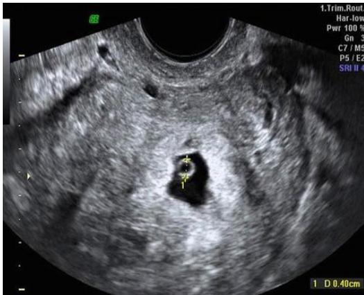
Figure 2: Transvaginal ultra-sonography of ectopic pregnancy

abnormal pregnancy and greater than 20ng/ml usually indicates abnormal intrauterine pregnancy [12] .