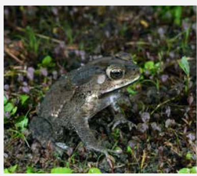
Figure 3. The Common Asian Toad, Duttaphrynus melanostictus .