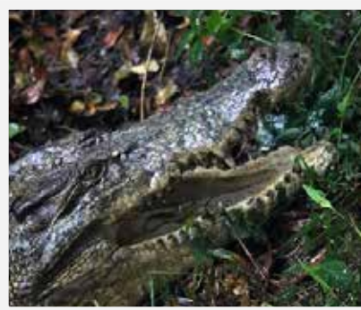
Figure 4. Saltwater Crocodile, Crocodylus porosus .