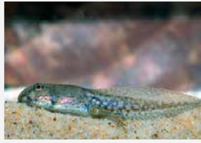
Figure 2. Tadpole of the Mangrove Frog, Fejervarya cancrivora .