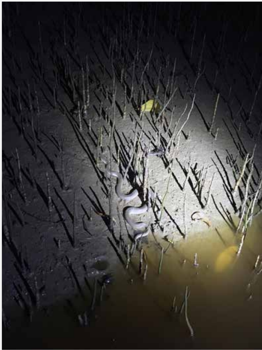
Figure 5. Cerberus rynchops on mangrove edge.