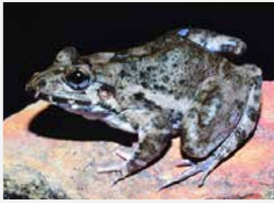
Figure 1. The Mangrove or Crab-eating Frog, Fejervarya cancrivora .