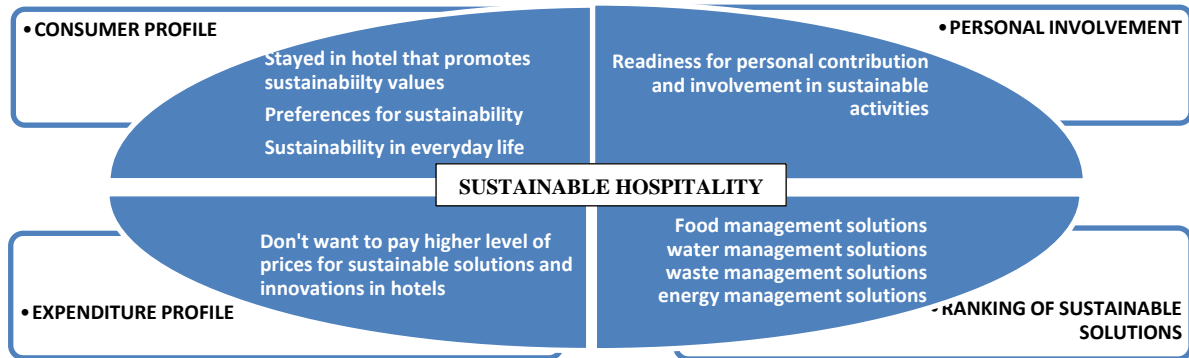
Figure 2. Perception of sustainable solutions in the hospitality industry – tourism demand

The research resulted in an exceptionally high level of answers by respondents, who claim that sustainable initiatives and management of resources and business organisation are important for the recognisability and competitiveness of a hotel. The summarised grade of importance is highlighted (the sum of grade 5 and grade 4) importance of sustainable: waste management (85.3%), energy management (89.3%), water management (90.2%), food management (93.1%). Ranking evaluation shows that respondents find that the most important is sustainable food and provision management (grade 4.6), followed by sustainable water management (4.4), waste management (4.3) and sustainable energy management (4.2).