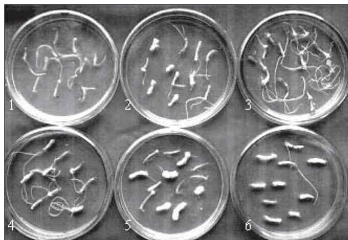
Fig 1. Regeneration response in hypocotyl explants upon Agrobacterium co-cultivation cultured on MS medium containing different hormone combinations: 1) 1 \mu M BAP+0.05 \mu MNAA, 2) 1 \mu M BAP+0.1 \mu MNAA, 3) 2 \mu M BAP+0.05 \mu MNAA, 4) 2 \mu M BAP+0.1 \mu MNAA, 5) 3 \mu M BAP+0.05 \mu MNAA, 6) 3 \mu M BAP+0.1 \mu MNAA

There was a drastic reduction in the regeneration