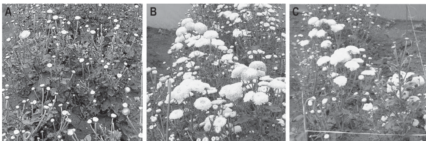
Fig 2. Performance of chrysanthemum plants in the field following direct planting of acclimatized plants (A), acclimatized plants after a month in field nursery (B), and, conventional sucker-derived plants at one month in field nursery (C)