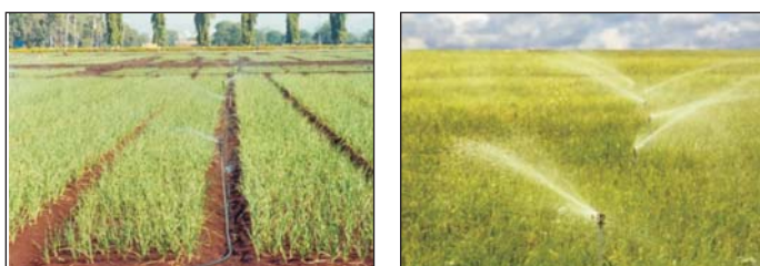
Micro irrigation in onion and garlic

Studies at MPKV, Rahuri revealed that highest bulb was obtained with drip irrigation at 100% CPE. Water-expense efficiency was higher with all rates of drip irrigation than with surface irrigation (Patel et al , 1996). Studies on the efficacy of the micro-sprinkler irrigation revealed increased yield of garlic with decrease in micro-sprinkler spacing by 38% (Pawar et al , 1998). The micro-sprinkler irrigation method was suitable for irrigating a close-growing crop like garlic by closely spacing the micro-sprinklers. Among the irrigation methods evaluated, drip irrigation at 100% PE recorded the highest marketable bulb yield in both the crops with 30-40% water saving in comparison with surface irrigation (Sankar et al , 2008, 2009).