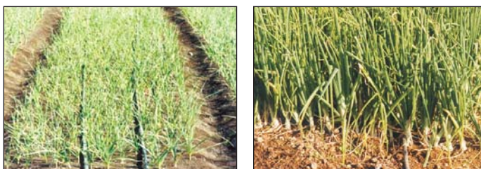
Fertigation in onion and garlic

Drip irrigation with the recommended rate of solid fertilizer in 2 applications gave the highest bulb yield (496.35 q/ha) while drip fertigation at 50% of the recommended rate gave the highest bulb quality in onion (Chopade et al , 1998). Optimum yield and acceptable bulb quality of onion was obtained from drip irrigation, combined with fertigation using NPK liquid fertilizer @150:125:200 kg/ha Balasubramanyam et al , 2000. In the case of garlic, higher yield response was obtained by fertigation than by soil-application of N. Split application of N at 120 kg/ha produced higher yields. Overall results indicated that with N fertigation improved bulb yield, NUE, and WUE (Mohammad and Zuraiqi, 2003). Higher yields of garlic were obtained by P application at 80 kg/ha through drip-fertigation. According to Rumpel and Dysko (2003), higher marketable yields were produced when 50 kg N/ha was applied through fertigation