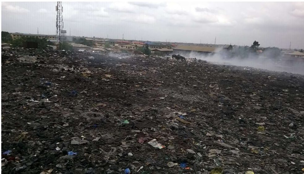
Figure 1: Abule-Egba Dumpsite.

In order to properly evaluate these risks, mapping and characterizing the leachate plume is pertinent. There are several techniques for these purposes, however, several of them only provide limited spatial subsurface information which might generate incomplete site investigation thereby resulting into inadequate remedial designs. Geophysical surveys can reduce this gap in provision of spatial information by generating an extensive lateral coverage without jeopardizing the needed high resolution information. Geophysical techniques are non-invasive and have been extensively used for subsurface characterization, in particular electrical resistivity tomography (ERT) has been used for groundwater exploration and pollution studies [6-12]. In this research, we used surficial ERT method to monitor the lateral coverage and migration of leachate plume within the subsurface of an open dumpsite around Abule-Egba, Lagos (Figure 1).