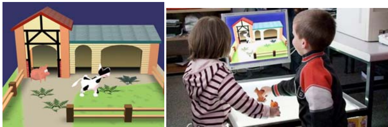
Fig. 2. The "Collecting strawberries" game.

Sessions were video recorded with two cameras: one took the TV image of the game evolution, and the other took the children actions with the toys over the tabletop. Additionally, the software recorded the toy's paths on the table during the game. A competitive game, "Collecting strawberries", was used to detect interaction problems. The 3D scenery is a field with several plants (see fig. 2). Each of the two players chooses one farm animal to play with. Some plants hide strawberries and children compete for collecting them. To do this, children have to move the toy animals onto a plant location. Here, we will briefly explain the problems observed during the test sessions, grouped by the SEEM category, and the solutions that were carried out to solve them.