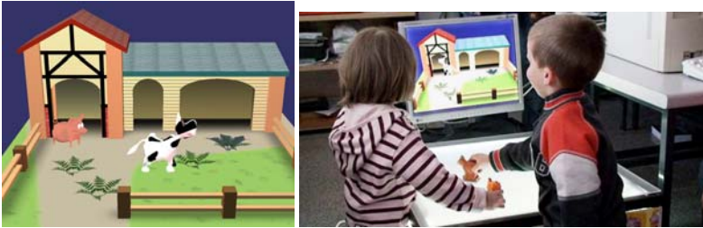
Fig. 2. The "Collecting strawberries" game

A competitive game, "Collecting strawberries", was used to detect interaction problems. The 3D scenery is a field with several plants (see fig. 2). Each of the two players chooses one farm animal to play with. Some plants hide strawberries and children compete for collecting them. To do this, children have to move the toy animals onto a plant location. Here, we will briefly explain the problems observed during the test sessions, grouped by the SEEM category, and the solutions that were carried out to solve them.