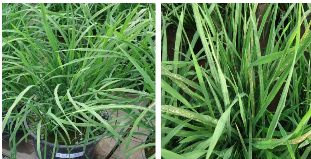
Fig 2. Rice plants at one and seven days, respectively, after the application of 1600 \text{ g ha}^{-1} \text{ ZnCl}_2 in V_{11} vegetative stage.

ns No significance at p \leq 0.05 . *Significance at p \leq 0.05 . ** Significance at p \leq 0.01 .