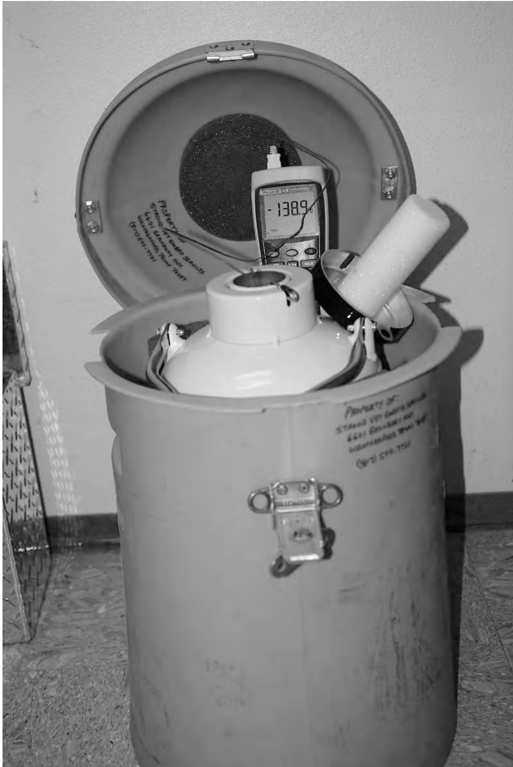
Figure 2. Dry shipper 10 days post charging with liquid nitrogen. Temp – 138.9° C

Plastic goblets snapped onto canes inside dry shippers will not have liquid nitrogen in them, so time in the neck of the shipper should be kept to a minimum when viewing or handling the contents. The eight second rule also applies to dry shippers. Canes of semen or embryos