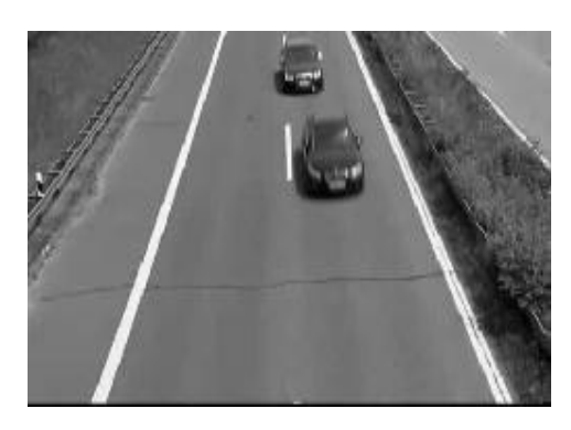
Fig.3. original frame