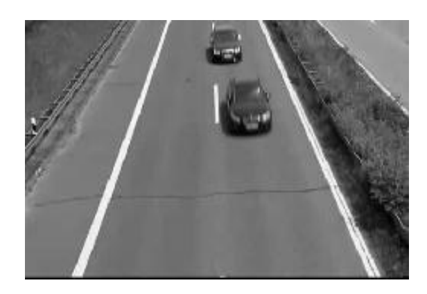
Fig.1. original frame

In Figure 2, shows the detection object using Kalman filtering method. The image is smooth, clean and the object is clearly detection. The number of vehicles in given video is 9.In fig.1 big noises are considered as on vehicle. This is the drawback of Gaussian method.