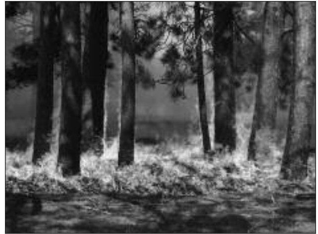
Fig. 3. Prescribed fire used in a red pine stand, Seney National Wildlife Refuge.