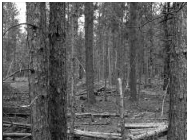
Fig. 4. Before (left) and after (right) views of a harvested pine stand managed to reduce fuels and restore mixed-pine forest ecosystem characteristics, Seney National Wildlife Refuge.

2005). Additionally, research conducted at SNWR indicates that stands with greater structural diversity (including more coarse woody debris and snags) also have more diverse small mammal communities, which are an important component of northern forest ecosystems (Harrington 2006).