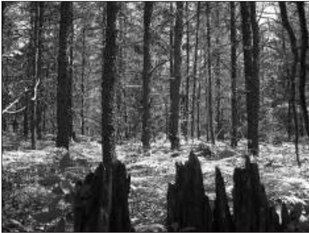
Fig. 1. Jack pine stand with large-diameter eastern white pine stump in foreground, Seney National Wildlife Refuge.