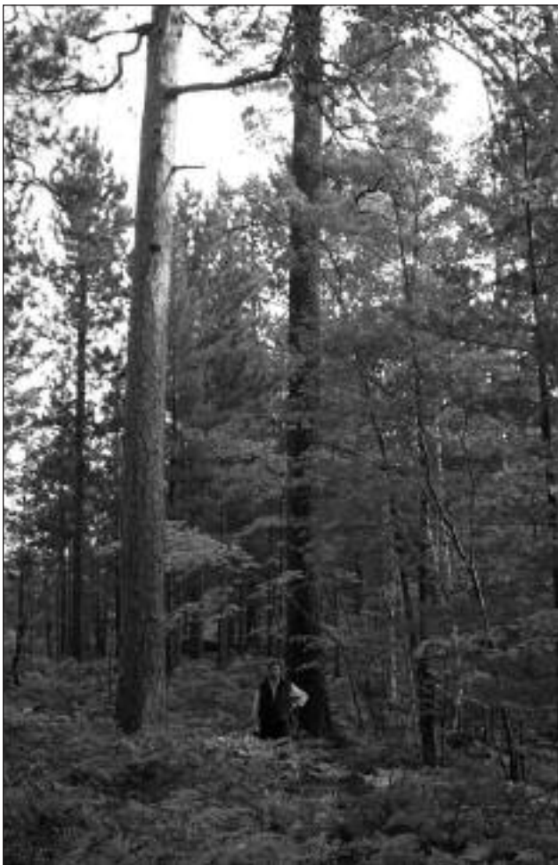
Fig. 2. Old-growth eastern white pine (center) and red pine (left) in the Seney Wilderness Area, Seney National Wildlife Refuge.

ment forests (Zhang et al. 2000). However, less than 1% of the primary red pine and eastern white forests exists and most of these forests have been structurally and compositionally altered due to past land-use actions (Drobyshev et al. 2008a, b; Fig. 1).