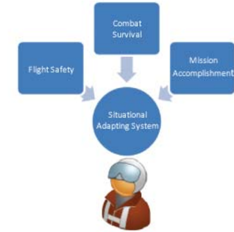
Figure 3. A situational adapting system would aid the pilots to balance the three perspectives of the situational picture: flight safety, combat survival and mission accomplishment.

support fighter pilots to create and maintain TSA. A situational adapting system is defined as a system that is able to respond to changes in the environment, as given by the situation analysis . It has been argued that such a decision support system would aid the pilots to balance the three perspectives of flight safety, combat survival and mission accomplishment previously mentioned (see Figure 3). The adaptivity of the system envisioned in Erlandsson et. al. 5 can be manifested in terms of changes in the user interfaces as well as the presentation of recommendations of suitable actions, adapted to different types of information, tasks and missions.