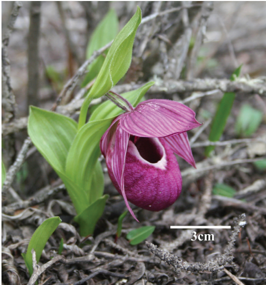
FIGURE 1. Cypripedium tibeticum flowers in China's Sichuan Province in China are pollinated by queen bumblebees searching for nest sites (Li et al. 2006). The dark entrance of the lip and the position of the flower near the ground are thought to mimic a mouse hole, a common nest site. The queen enters the lip, becomes trapped, and escapes by squeezing beneath the stigma and then an anther at one the lateral openings at the junction of the bases of the lip and petals, delivering and removing pollen in the process. This trap-lip pollination mechanism occurs in all slipper orchids. Most Cypripedium species are pollinated by bees but diverse types of flies have recently been found to be the pollinators of small-flowered species.

belonging to diverse species (Edens-Meier et al. , in press), a characteristic that facilitates their attraction and entrapment. Eight Cypripedium species are pollinated by small bees belonging to different bee families. The most important bee family is Halictidae (sweat bees), followed by the Andrenidae (mining bees). A few bee species of minor importance belong to the Megachilidae (leaf-cutter bees), Colletidae (plaster bees), and Apidae (varied bees including bumblebees and honeybees). It is notable that honeybee pollination has been detected in only a single species of Cypripedioideae , the North American C. reginae , which has diverse pollinators; honeybees are not native to North America. Bees in Halictidae and Andrenidae are the sole pollinators of some Cypripedium orchids. The halictid pollinators belong to four genera with Lasioglossum species being