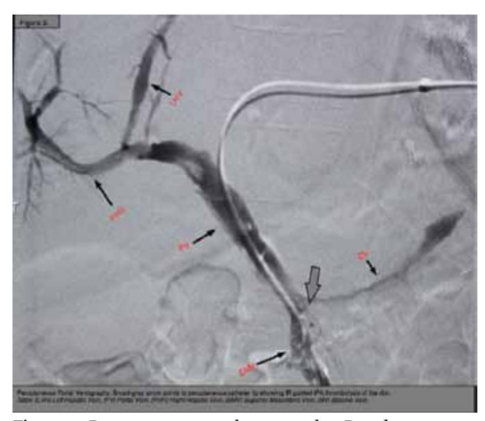
Figure 2: Percutaneous portal venography. Broad grey arrow points to catheter tip showing interventional radiology guided tPA of clot.

Abbreviations: LHV Left hepatic vein, RHV Right hepatic vein, PV Portal vein, SMV Superior mesenteric vein, SV Splenic vein