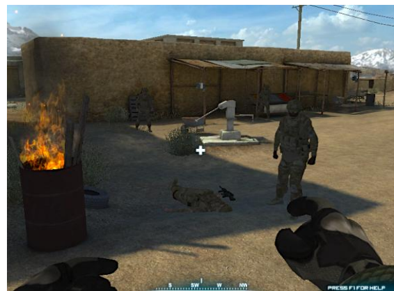
Figure 1. vMedic learning environment.

Q-Sensors recorded participants' physiological responses to events during the study. The Q-Sensor is a wearable arm bracelet that measures participants' electrodermal activity (i.e., skin conductance), skin temperature, and its orientation through a built-in 3-axis accelerometer. However, Q-Sensor logs terminated prematurely for a large number of participants, necessitating additional work to determine the subset of field observations that are appropriate to predict with Q-Sensor-based features. Inducing Q-Sensor-based affect detectors will be an area of future work.