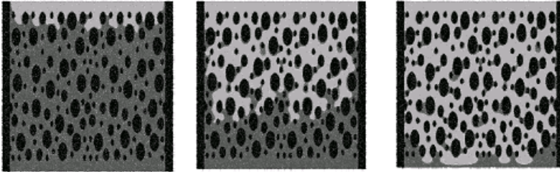
Figure 2: Three stages in a 2-dimensional simulation of the gravity driven penetration of a dense non-wetting fluid into an anisotropic porous medium

To simulate fluid flow in confined systems such as porous media and fractured porous media it is convenient to use stationary particles to represent the confining solid phase with a combination of short range repulsive interaction and (relatively) long range interactions between the liquid particles and the solid particles. Bounce back boundary conditions (reversal of particle velocities) can be used to return to the fluid particles that penetrate too far into the solid, and if this is done only a thin layer of solid particles near the solid-fluid interface is needed. A similar approach can be used to simulate multiphase fluid flow by labeling the particles to indicate which fluid component they represent and using different interaction potentials ( U_{11}, U_{12}, U_{22} \dots , etc. for a multi-component fluids). Figure 2 illustrates a two-dimensional simulation carried out in this manner. In addition, a similar approach can be used to simulate unconfined liquid drops (single component, two phase fluids) [Tartakovsky and Meakin, 2005].