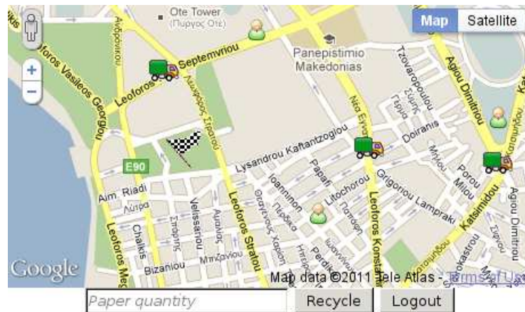
Fig. 2. Web Interface of EcoTruck Application

In [10] authors employ multi-agent simulation coupled with a GIS to assist decision making in solid waste collection in urban areas. Although the approach concerned truck routing, it was in a completely different context than the one described in the present paper: the former aimed at validating alternative scenarios by multi-agent modelling in the waste collection process, while EcoTruck aims at dynamically creating truck paths based on real time user requests.