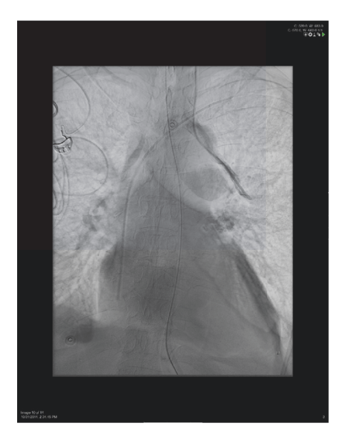
FIGURE 2: Fluoroscopy study showing left IJ CVL extending through the anomalous pulmonary vein.

FIGURE 1: Single frontal view CXR showing the tip of the left IJ CVL extending left of the aortic arch towards the left lung field.