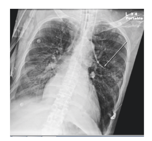
FIGURE 1: Single frontal view CXR showing the tip of the left IJ CVL extending left of the aortic arch towards the left lung field.