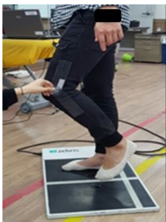
Figure 2. Measurement of static balance.

a self-selected comfortable speed until the end of the board. Subjects were asked to begin walking 1 meter before the GAITRite walkway and up until 1 meter after the walkway at a comfortable speed while the spatial and temporal data were obtained during the middle 5 m (Figure 3).