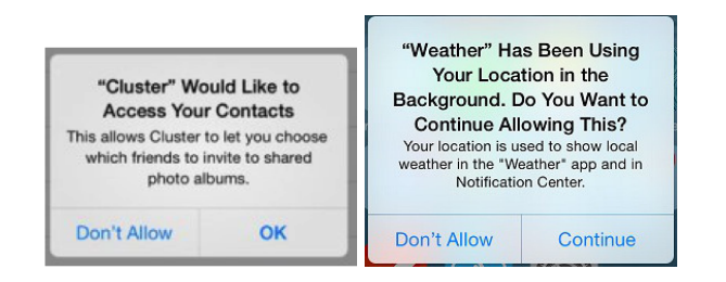
Figure 3: iOS's just-in-time notice with purpose explanation (left) and periodic reminder (right).

odic reminders for apps that have permission to access the user's location in the background, see Figure 3. Both iOS and Android also use a persistent location icon in the toolbar indicating that location information is being accessed.